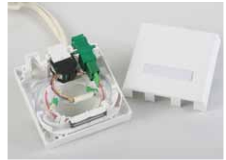
3M™ FTTH Wall Outlet 8686

The 3M™ FTTH Wall Outlet 8686 is compatible with round and FRP-type indoor drop cables with 30mm bend radius.