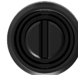
- notch type