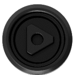
- triangle type