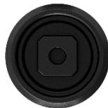
- square type