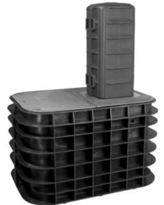
FTTP SGLB system with MGF1010 housing mounted on SGLB2436 split cover (plug removed).