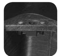
Threaded floating nut assembly